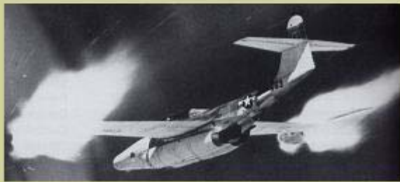
F-89 SCORPION FIRES A SALVO OF MIGHTY MOUSE ROCKETS FROM ITS WINGTIP PODS